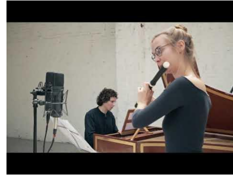
Sonata in e minor, Adagio – J.-M. Leclair