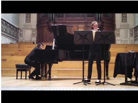
Le fou à pattes bleues – T. Murail live